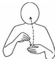
... and taking crisps to mouth